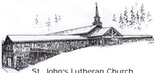
St. John's Lutheran Church 2190 Jackson Highway Chehalis, WA 98532 360/748-4741