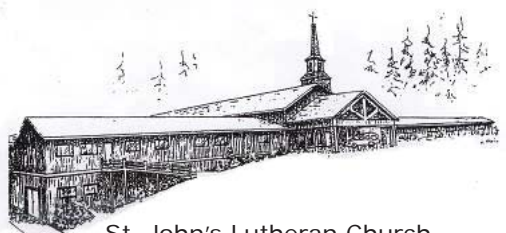
St. John's Lutheran Church 2190 Jackson Highway Chehalis, WA 98532 360/748-4741

(You may take your flowers home after the 11:00 a.m. Easter Sunday Service.)