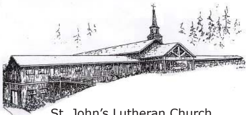
St. John's Lutheran Church 2190 Jackson Highway Chehalis, WA 98532 360/748-4741

Copies of the devotion are available in the church narthex. Large print books are available in the church office.