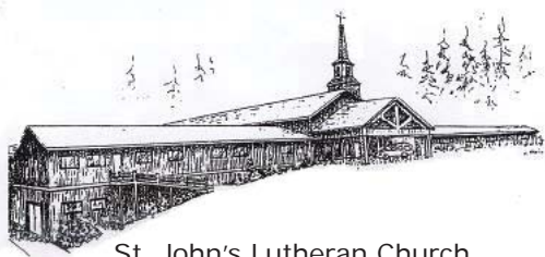
St. John's Lutheran Church 2190 Jackson Highway Chehalis, WA 98532 360/748-4741